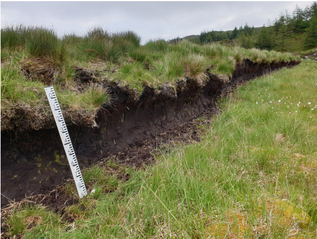
Evidence of peat cutting observed during site surveys 16/06/2020.