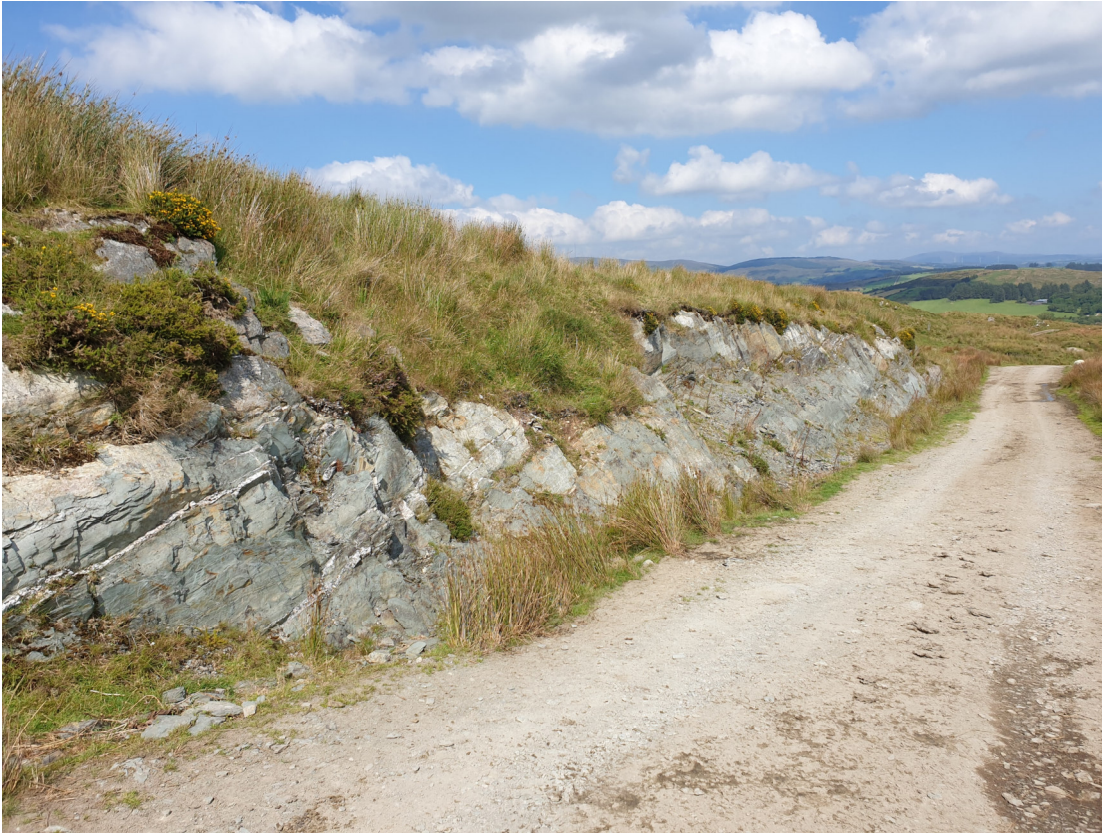
Exposed bedrock along existing access track observed during Surface Water Sampling R1 12/08/2020, near WC2 and WC4.