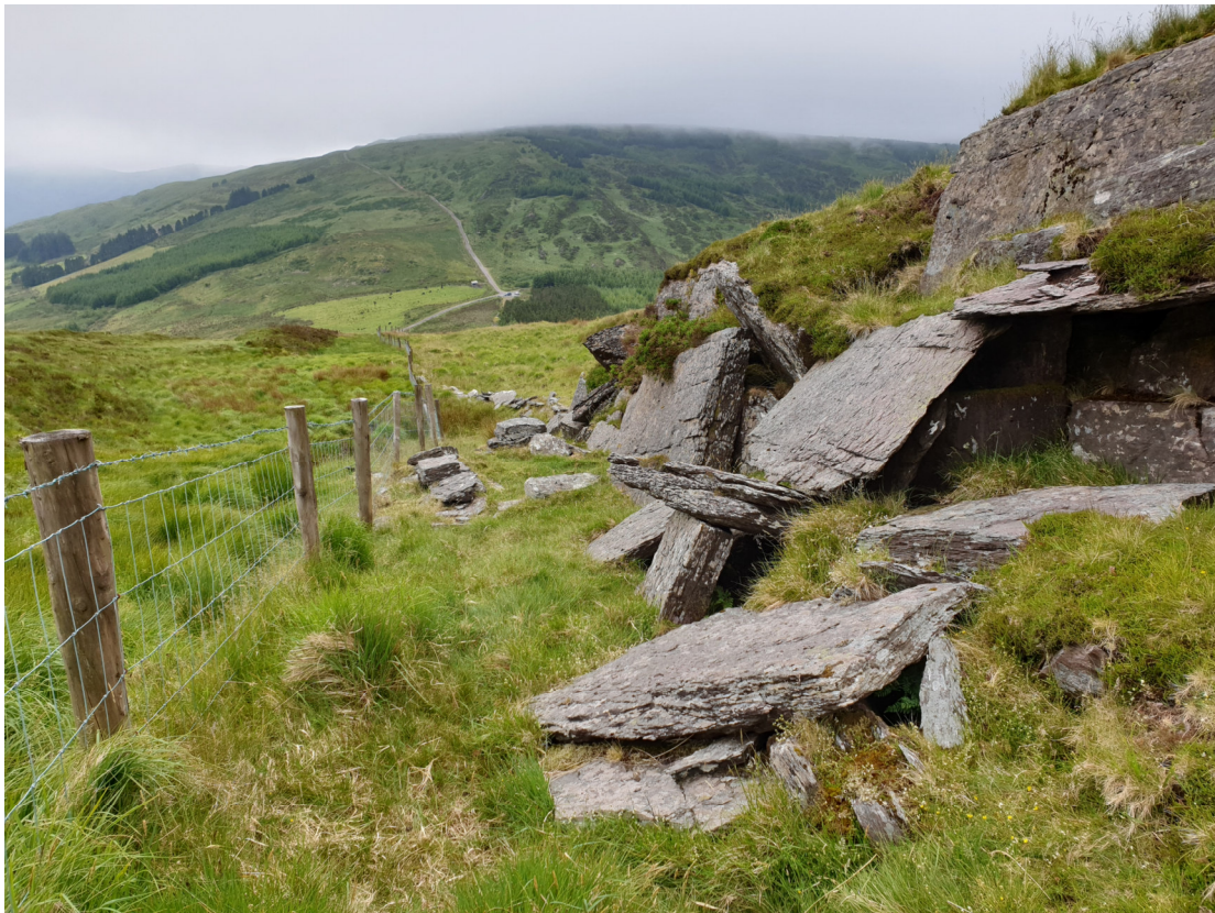
Exposed and weathered bedrock outcrop observed during site survey 16/06/2021.