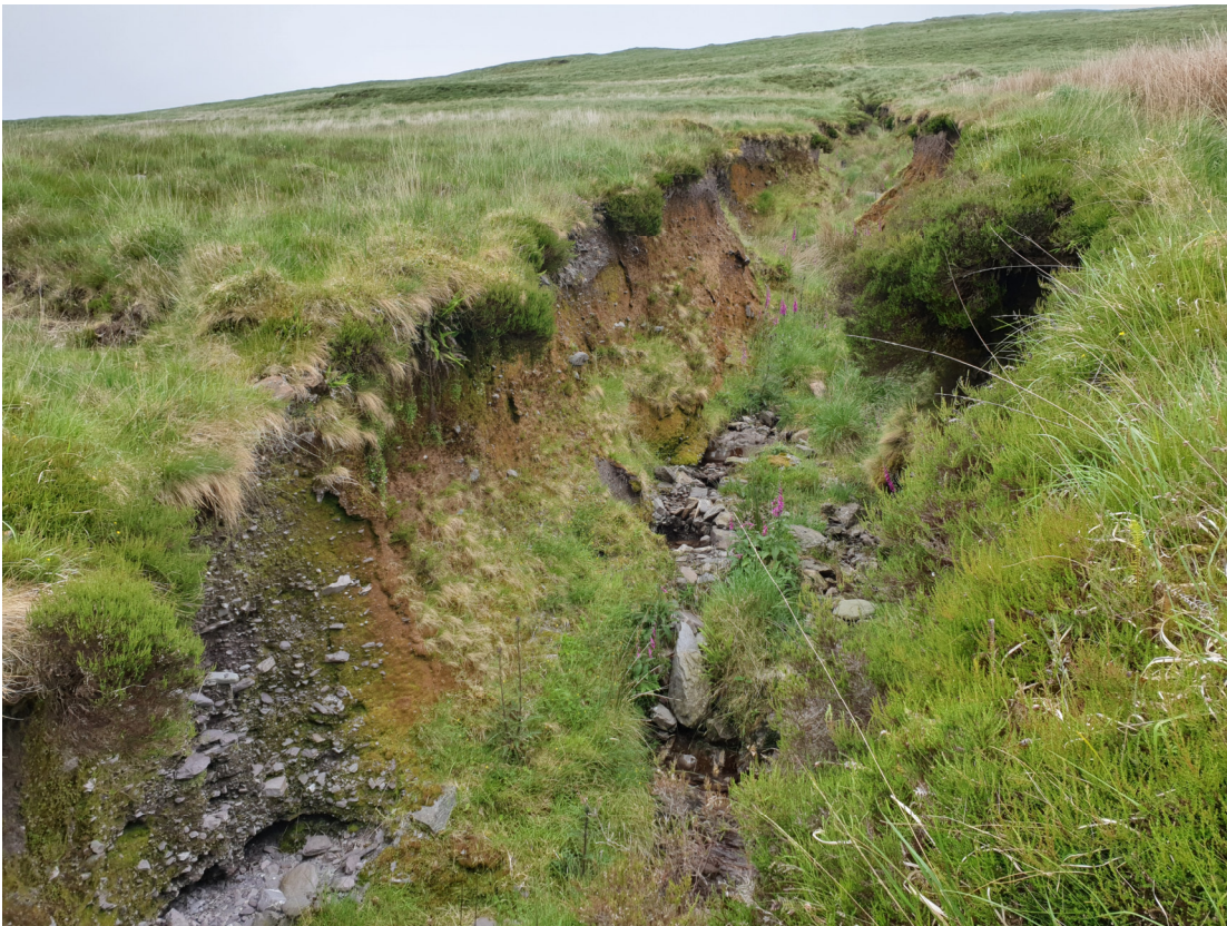
Natural drainage, deeply eroded channel in till observed during Site surveys 16/06/2020, near WC2.