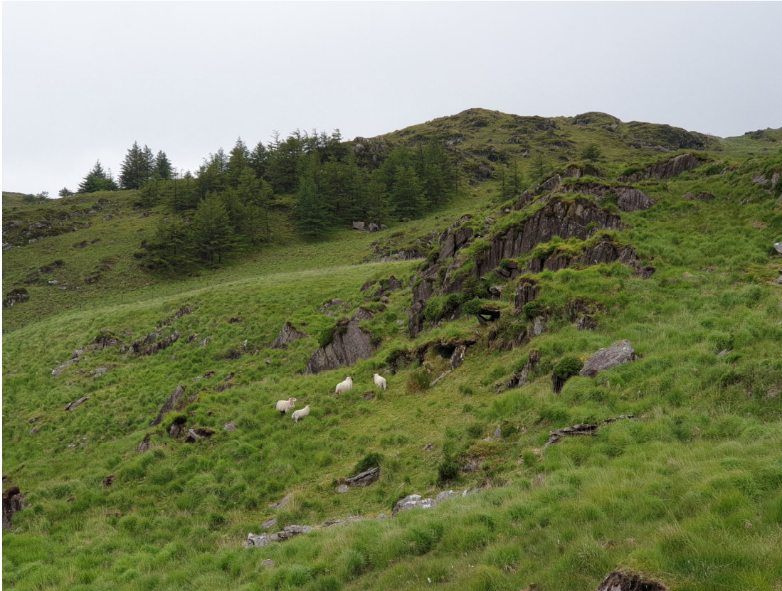
Steep and complex topography and exposed bedrock observed during site survey 16/06/2021.