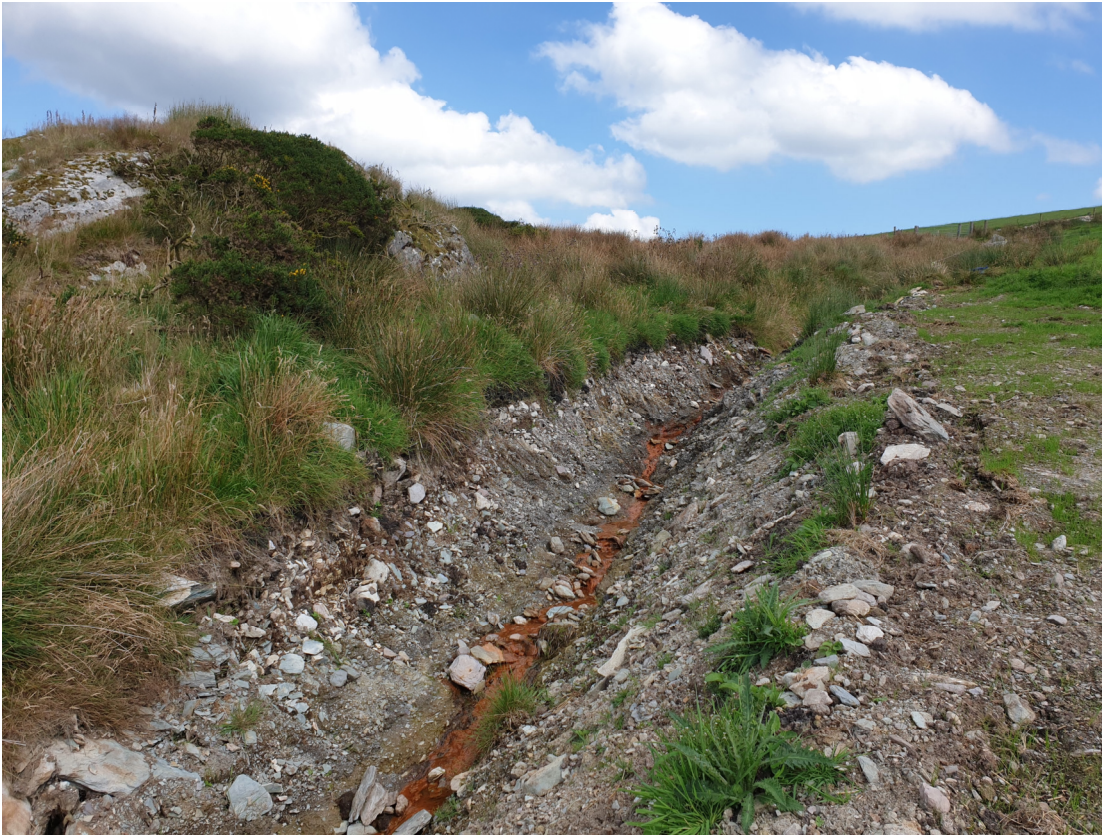
Recently excavated drainage observed during Surface Water Sampling R1 12/08/2020, near WC2.