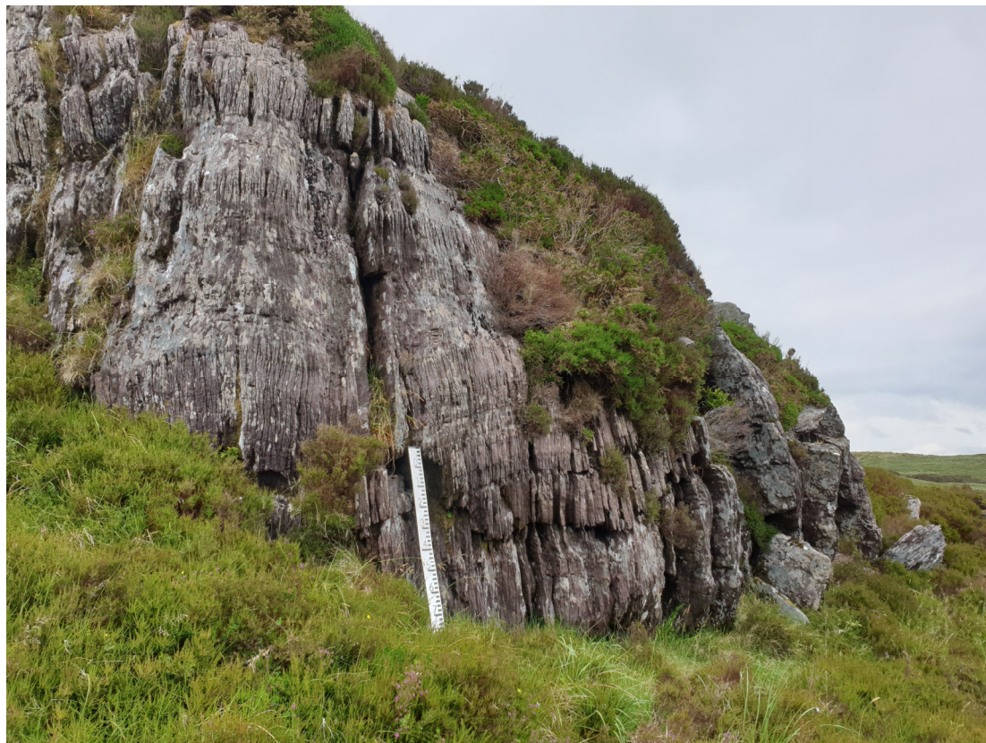
Exposed and weathered bedrock outcrop observed during site survey 18/06/2020.