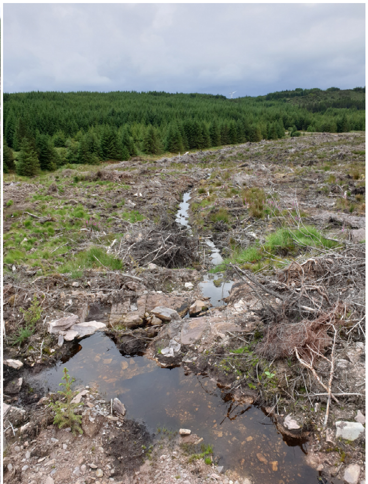
Recent forestry activity observed during site survey 18/06/2020.