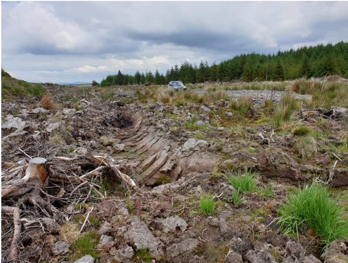
Recent forestry activity observed during site survey 18/06/2020.