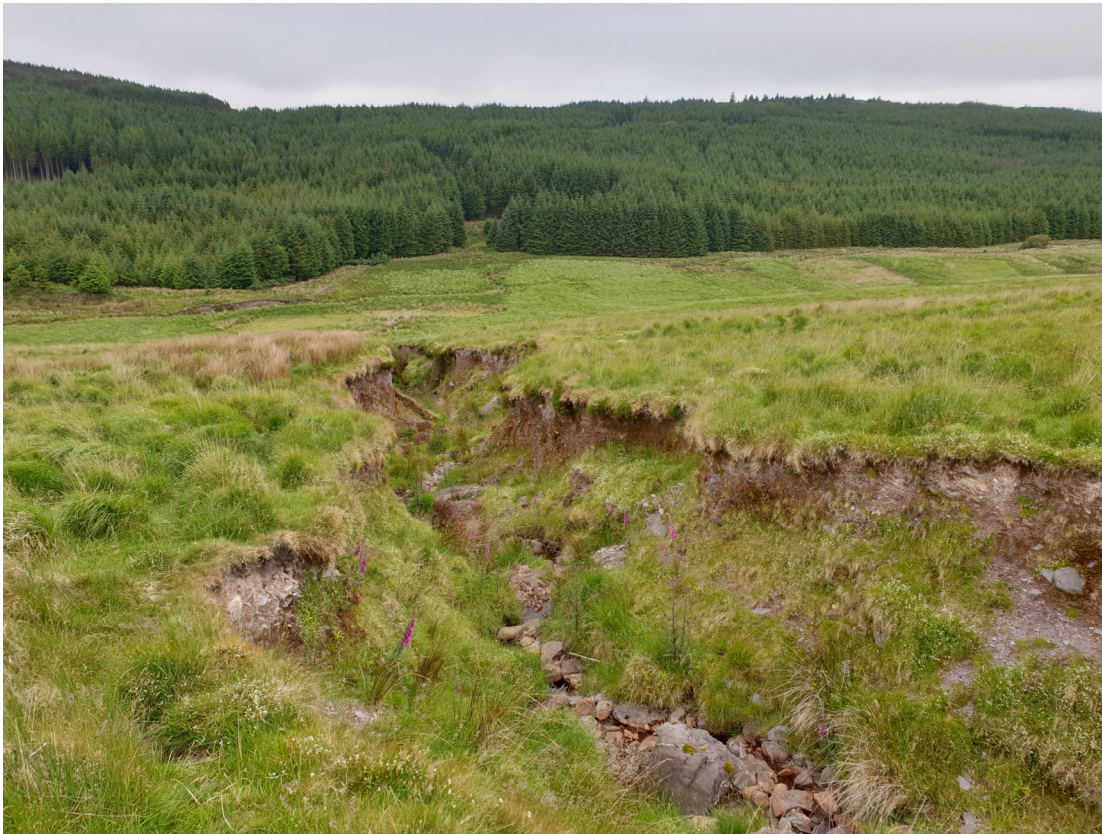
Natural drainage, deeply eroded channel in till observed during site surveys 16/06/2020, near WC2.